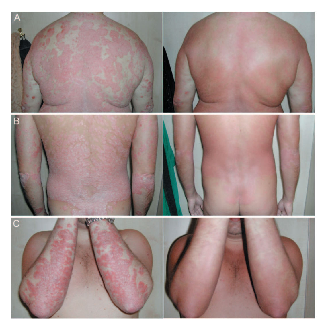
Figure 4. Three patients before and after a 3 week combined treatment with ichthyotherapy and UVA radiation.